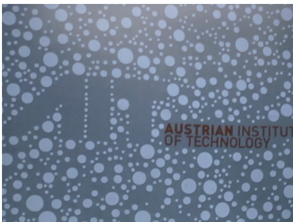
Figure 1: master image

“FlexInspect” is an innovative method for fast and highly precise image registration. FlexInspect allows a quick and very accurate correction of geometric image distortions taking place in the optical quality inspection. Only then it is possible to perform detailed comparison against a “target template” in order to detect any undesirable production deviations.