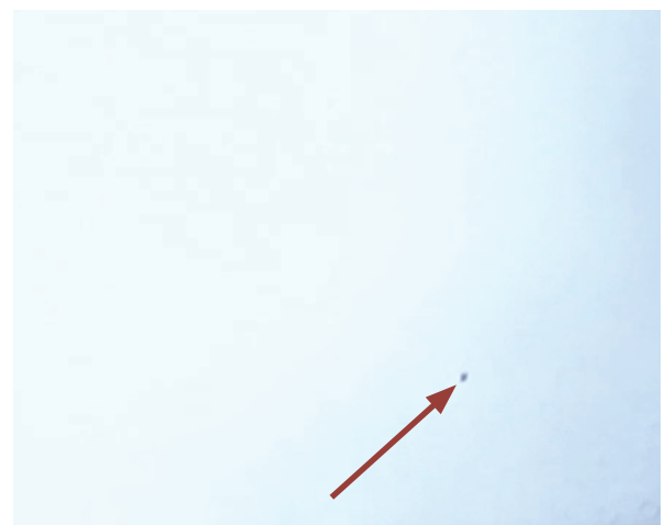
Figure 4: FlexInspect provides a distortion-free image alignment and thus ensures optimal inspection performance. Small printing defects can be detected.